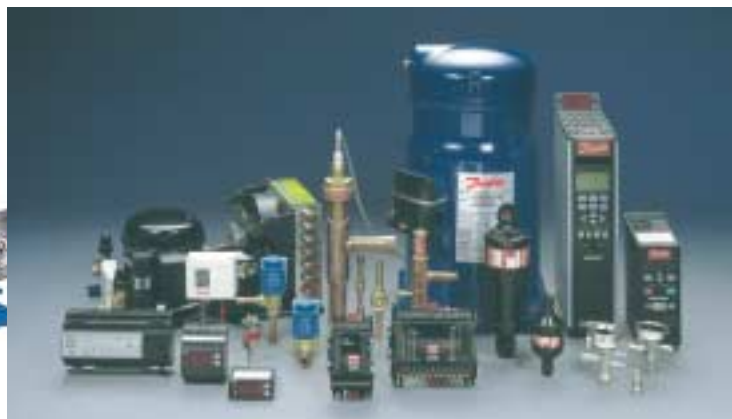
Danfoss, a full programme of energy efficient refrigeration components